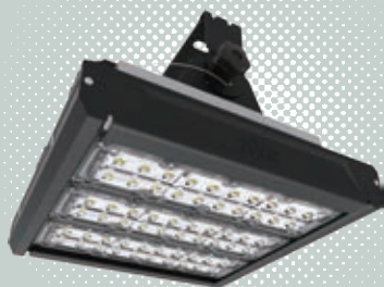
Tunnel Light Series 隧道燈系列