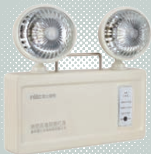
Emergency Light Series 2 消防應急系列二