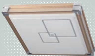
Aluminum Light Series 鋁材燈系列

Samples of Main Products of Home Lighting Luminaire: 家居照明燈具主要產品示例：