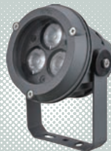
Flood Light Series 投光燈系列