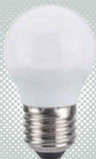
Bulb Lamp Series 球泡燈系列