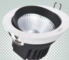
Ceiling Light Series 天花燈系列