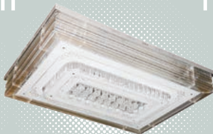
Flat-panel Low-voltage Light Series 平板低壓燈系列