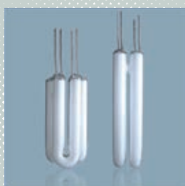
U-shaped Energy-saving Lamp Tube Series U型節能燈管系列