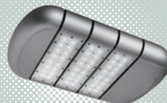
Street Light Series 路燈系列