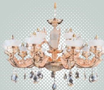
Candle Light Series 蠟燭燈系列