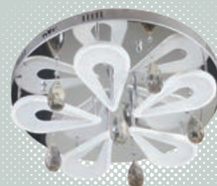
Acrylic Light Series 亞克力燈系列