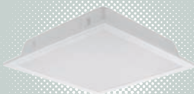
Panel Light Series 燈盤系列