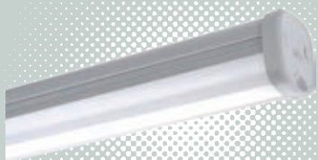
Batten Light Series 支架系列