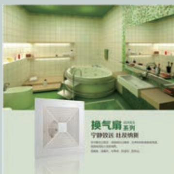
Ventilator Series 換氣扇系列