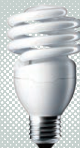
Spiral Energy-saving Lamp Series 螺旋節能燈系列