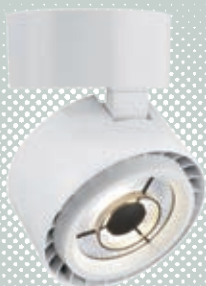
Track Light Series 軌道射燈系列

Samples of Main Products of Commercial Lighting Luminaire: 商業照明燈具主要產品示例：