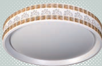
Wrought Iron Light Series 鐵藝燈系列