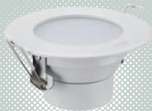
Downlights Series 筒燈系列

Samples of Main Products of Commercial Lighting Luminaire: 商業照明燈具主要產品示例：