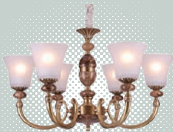
Brass Light Series 全銅燈系列