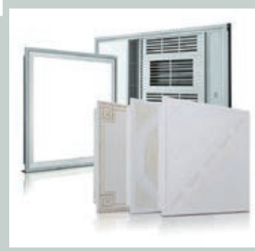
Integrated Ceiling Light Series 集成吊頂系列