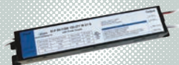
American Standard LED Drive Series 美標LED驅動電源系列