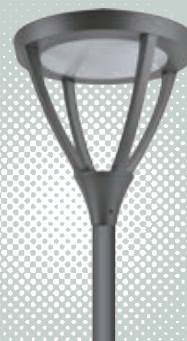
Garden Light Series 庭院燈系列