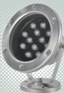
Underwater Light Series 水下燈系列