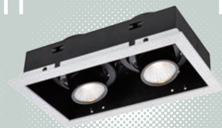
Multiple Light Series 格柵射燈系列