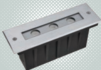
In-ground Light Series 埋地燈系列