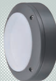
Wall Light Series 壁燈系列