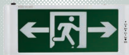
Emergency Light Series 1 消防應急系列一